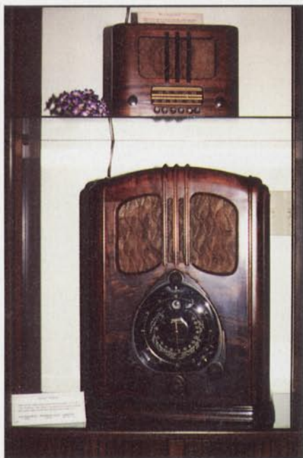
Historic broadcast receivers highlight the museum's collection.