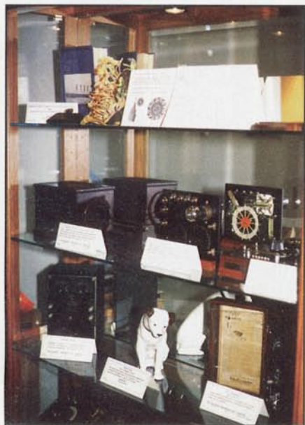
An eye-catching collection of equipment and memorabilia.

The Radio-TV Museum is a showcase for our Amateur Radio heritage with gems such as this Hammarlund HQ-129 (inset).