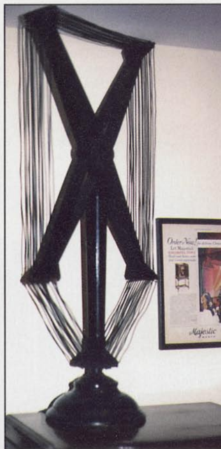
Enormous indoor antennas like this one were common in American homes in the early part of the century.

The Museum is open on Saturday and Sunday from 1 to 4 PM. Volunteer tour guides are available, or you can leisurely browse the exhibits by yourself. Group tours can be arranged by calling 301-